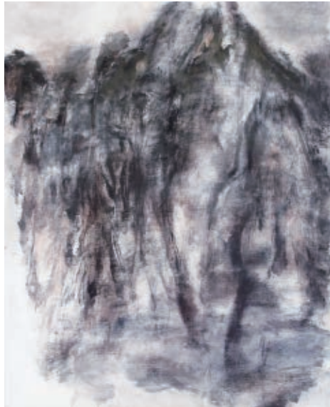
長濱石坑山之一 Shikong Mountain No. 1 粉彩、碳條、油彩、畫布 Pastel, charcoal and oil on 100x79.8cm 2014