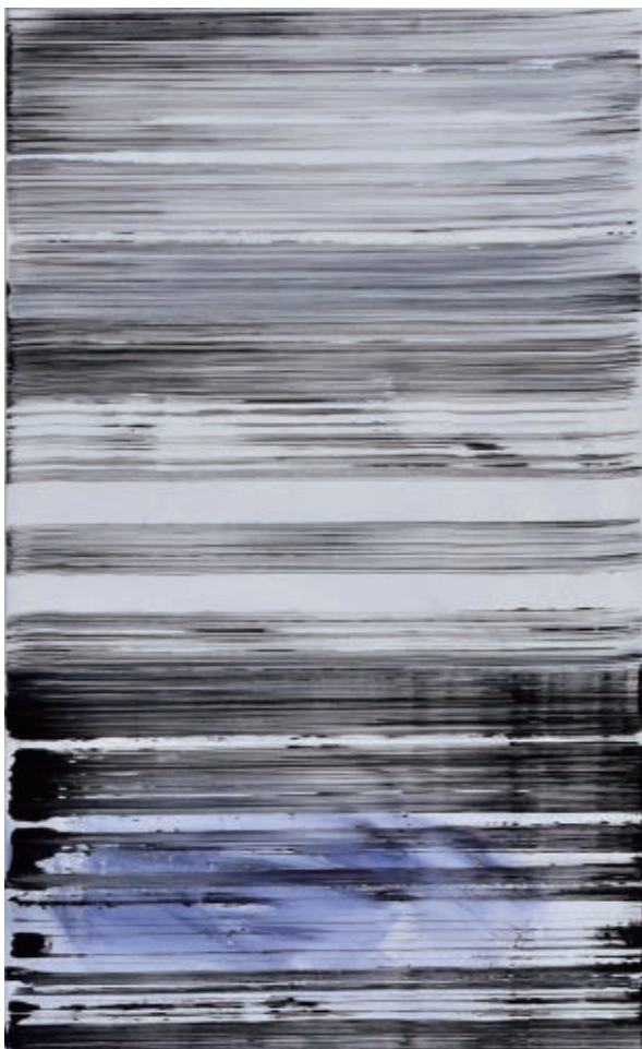
橫跨一頁天 Across Infinity And Beyond 壓克力顏料、畫布 acrylic on canvas 145.5x89.5 cm 2012

With his own power, Po -Lin Yang lights up the metropolis and wilderness with glory, and repeatedly and continuously reinterprets each location with its unique attributes and aesthetics.