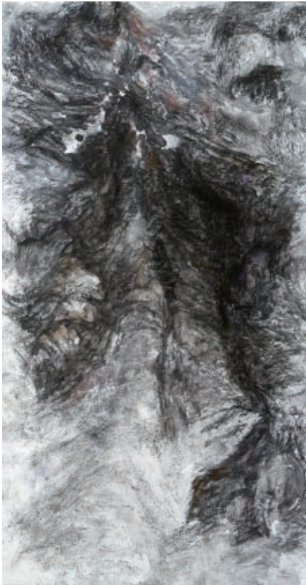
白沙橋之二 Baisha Bridge No. 2 粉彩、碳條、油彩、畫布 Pastel, charcoal and oil on canvas 140x260 cm 2015

makes her ink and wash paintings with the pigments of oil painting. It's a new creation, which is different from the tradition. When she lives in the countryside in Hualien, her creating topics turn gradually to the sketch of woods. Her emotion surge is obvious through her artworks. The pigments and coal unveil a new vitality, the unfathomable energy and beauty of age-old rocks. This natural mystery shall convey the endless love of life, love of the earth, love of art and culture!