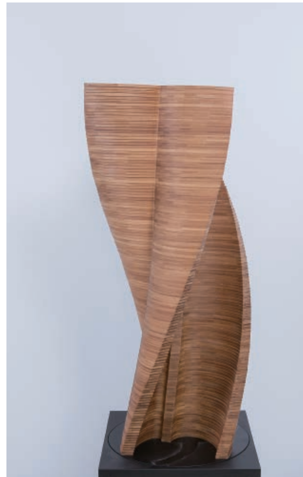
非想非非想天—動人 Touching 竹 Bamboo 40x40x104 cm(無底座) 2011

Yang's more renowned works include Pregnant, Heaven and Earth, and Flying Seeds series, Out of Earth, Sun Rises from the East, the Dance of Flame, Spring, the Island series and Majestic Barcode. He has participated in activities such as art salons, public art, landscape design and architectural organization. Yan has also won numerous awards and was invited to numerous international art exhibitions.