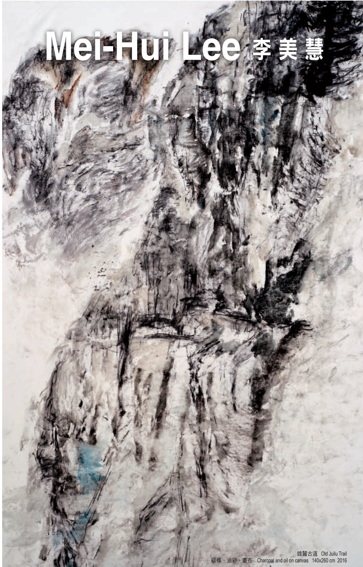
維蘭古道 Old Juulu Trail 碳條、油彩、畫布 Charcoal and oil on canvas 140x260 cm 2016

ART CENTRAL UOB 27 March - 01 April 2018 Central Harbourfront Hong Kong 香港中環海濱