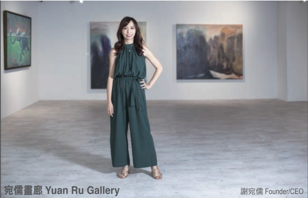
宛儒畫廊 Yuan Ru Gallery