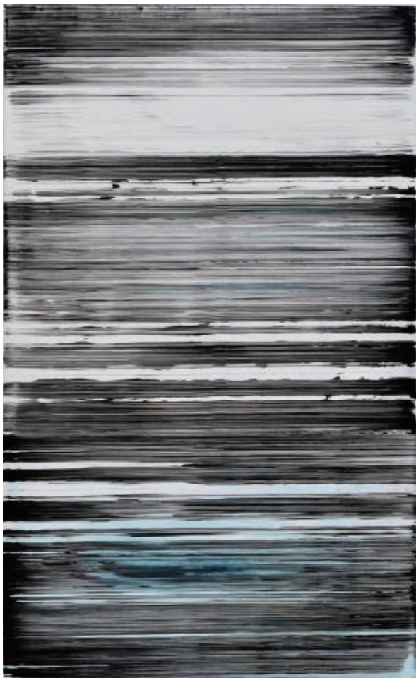
目送青談 Watching Idol 壓克力顏料、畫布 acrylic on canvas 145.5x89.5 cm 2012