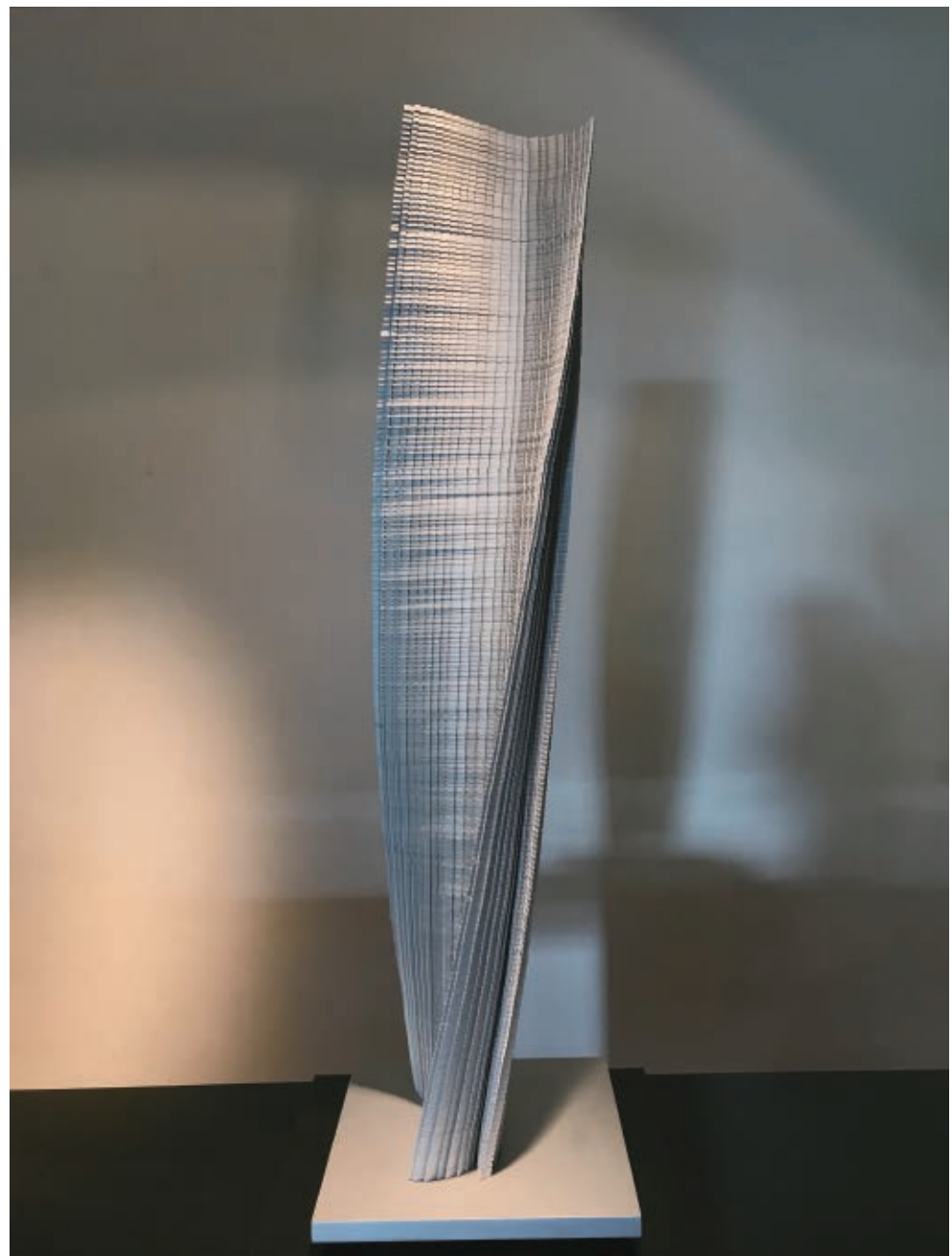
通往北極星的緯度 Latitude to Polaris 鋁合金 Aluminum alloy 30x30x106 cm(含底座) 2017