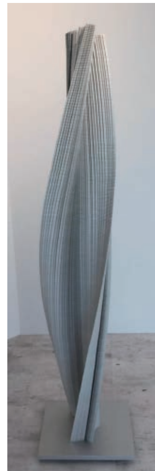
逆風行 Resist The Popular 鋁合金 Aluminum alloy 40x40x169 cm 2017